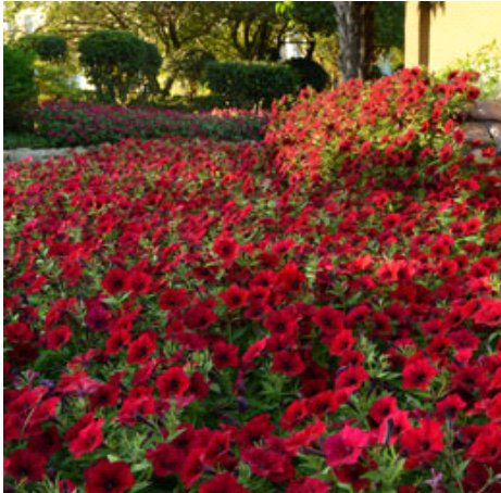
Wave Petunias are camera-ready!